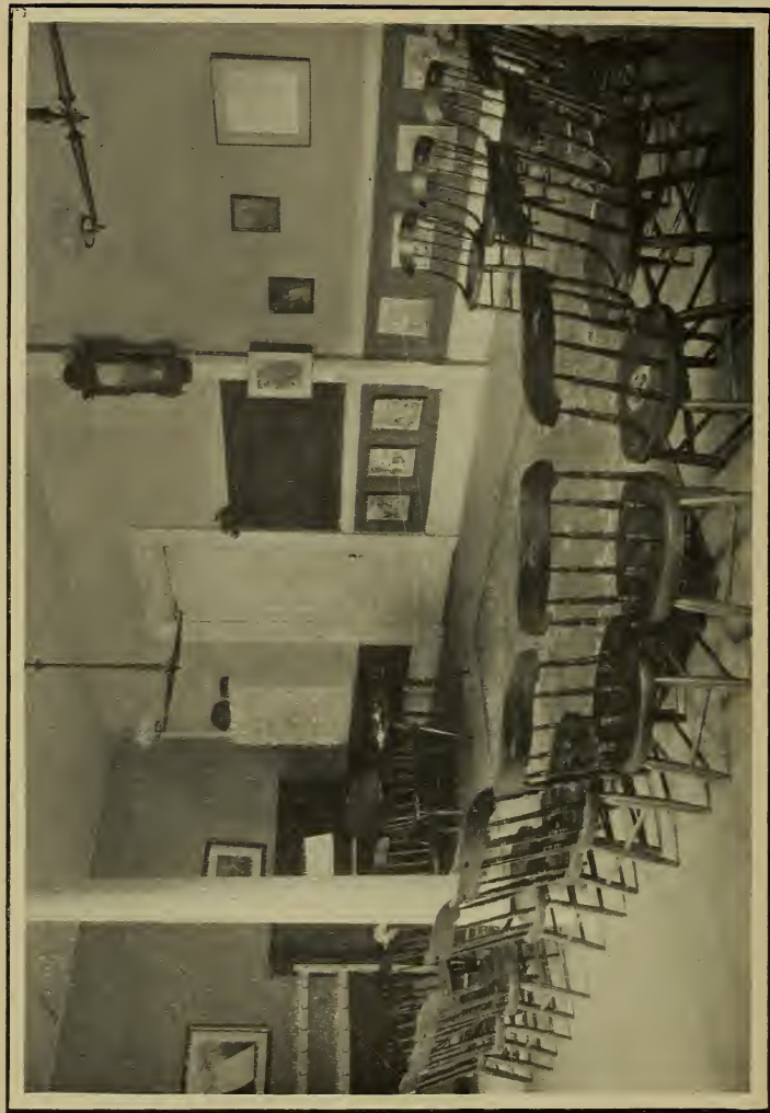
Southwest view, showing arrangement of chairs, with teacher's chair and low table, rug, cabinet for supplies, piano and blackboard painted on the wall